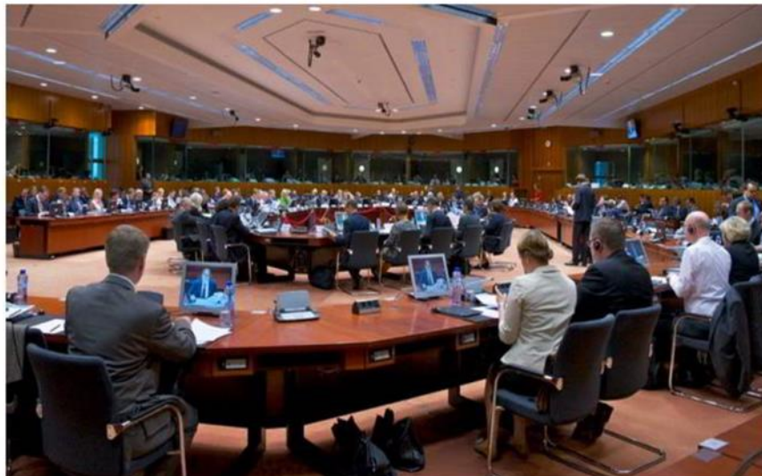
The Competitiveness Council meeting in Brussels this week.